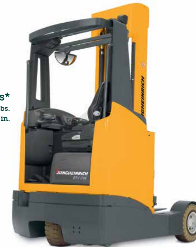
C-Series* capacity to 4,400 lbs. MFH to 291 in.