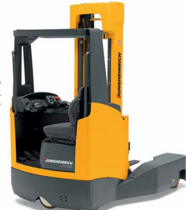
Q-Series* capacity to 5,500 lbs. MFH to 421 in.