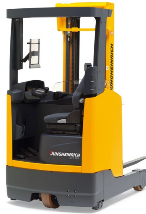
1-Series* capacity to 2,600 lb. MFH to 279 in.