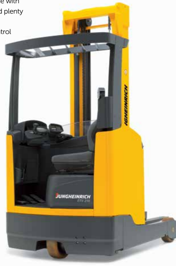
2-Series* capacity to 3,500 lbs. MFH to 421 in.